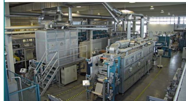
Coatema R&D Centre